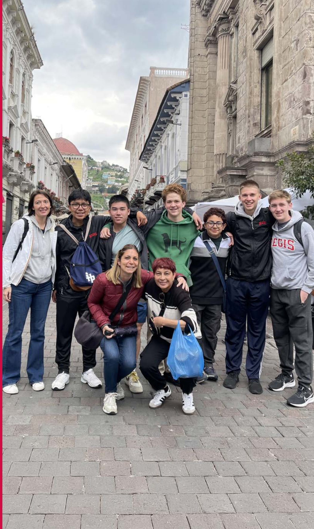
Above: Students traveled to Ecuador in June for a service immersion trip to Quito's Fundación Familias Trabajadores. To read more about this and other service and learning trips Regians took this summer, see page 10.

Some photographs for Regis publications are provided by Harisch Studios and the staff of The Regian , the school yearbook. Regis reserves the right to publish and edit all submissions.