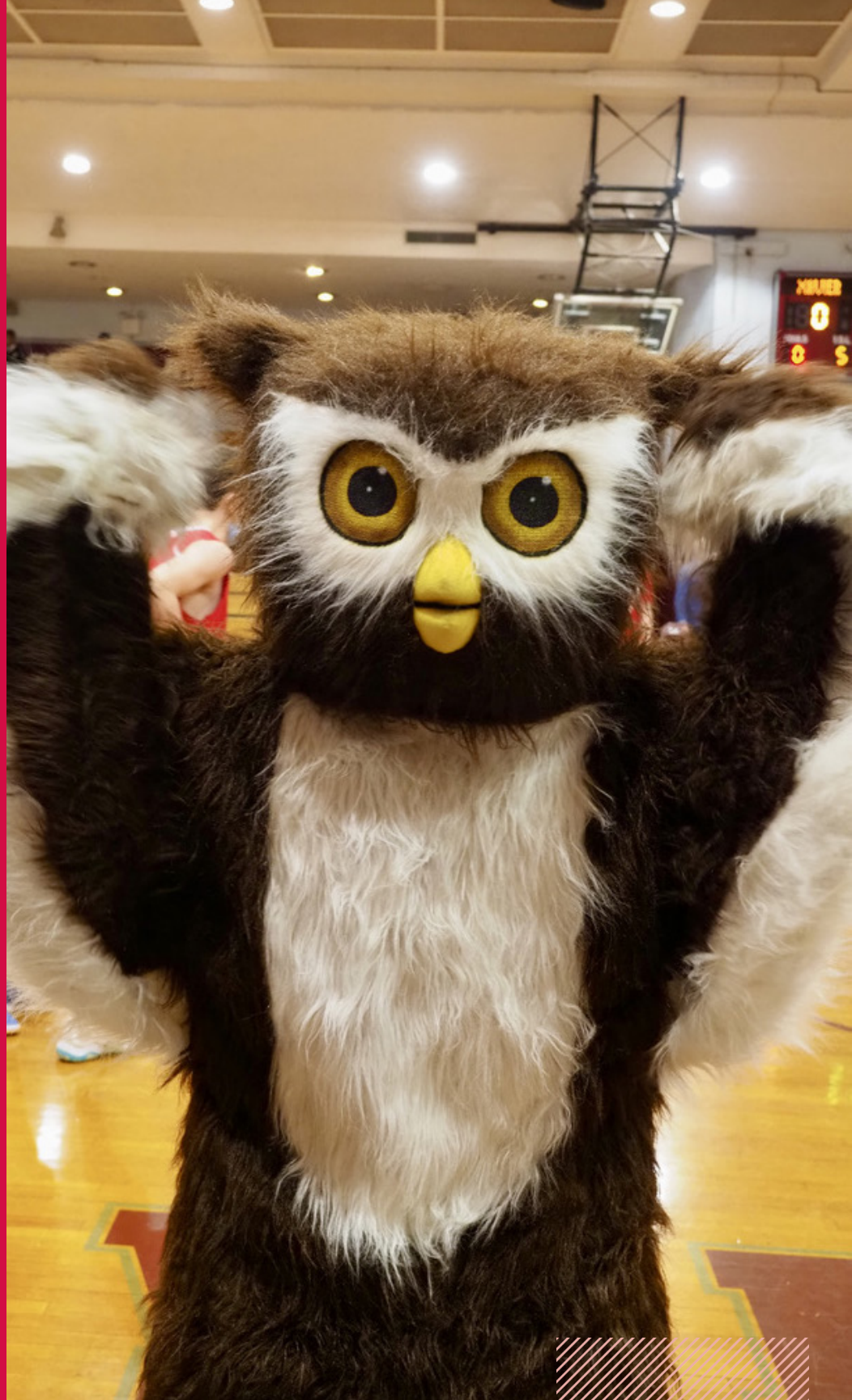
Above: The Regis Owl patrols the court at the Regis-Xavier Triple Header.