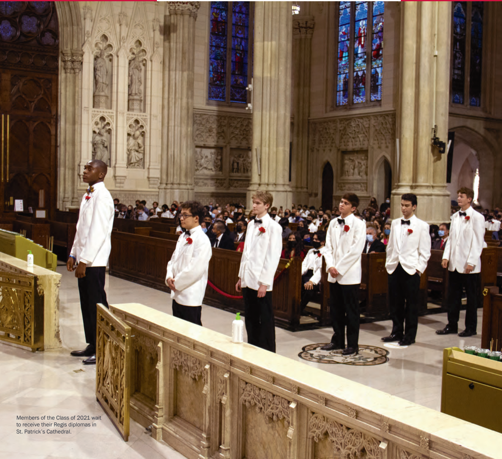
Members of the Class of 2021 wait to receive their Regis diplomas in St. Patrick's Cathedral.