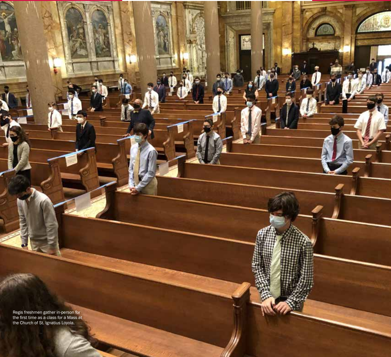
Regis freshmen gather in-person for the first time as a class for a Mass at the Church of St. Ignatius Loyola.